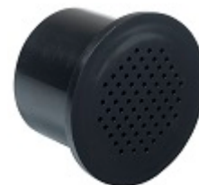
Active charcoal filter - FILTRE1 It's recommended to change it every years.

**Thanks to the Vinotag® application, benefit from a digital register of your wine cellar and be alerted of the peak dates of your wines. In partnership with Vivino, scan your bottle to access its pre-filled wine sheet.